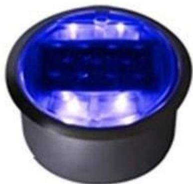
LightDeco Rigel 60