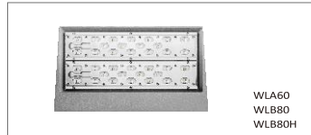
WLA60 WLB80 WLB80H