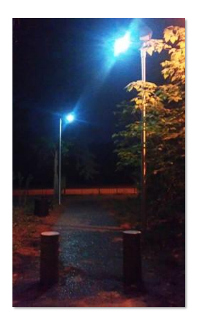
HighLight EXCEL - Public Path - Day & Night