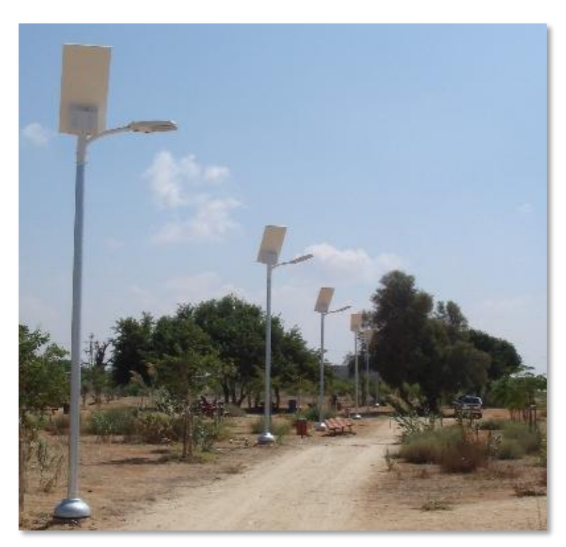
HighLight ALPHA – Remote parks