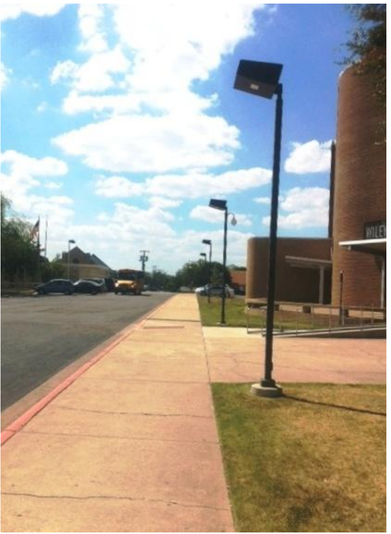
HighLight SUNBOX – University Campus